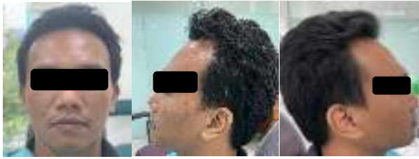
Figure 1 Extraoral photo