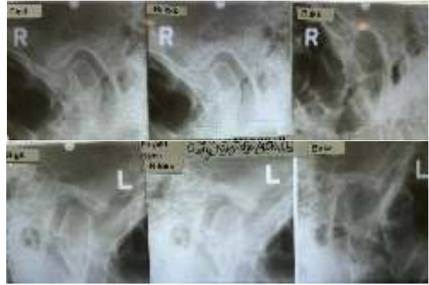
Figure 4 TMJ X-ray; R = right, L = left

Following a thorough examination, patient was diagnosed myalgia based on DC/TMD diagnostic tree with no articular joint disorder. Patient was also diagnosed migraine according to orofacial pain classification axis-1 following with anxiety disorder and stress. Patient was told to reduce his clenching habit during concentration and working, self-regulation to minimize stress. Patient were taught to do jaw regular jaw exercise 3-4 times a day with eight times repetitions such as opening mouth in front of the mirror in straight pathway, opening the mouth without pain, and lateral movement with restriction. Alginate impression and bite registration using bitewax were taken for the making of SA. Next visit was scheduled 2 weeks later.