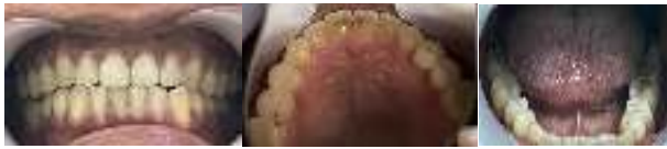
Figure 2 Intraoral photo

According to Axis-1 DC/TMD clinical examination, patient's overbite 2 mm and overjet 3 mm (Fig.2). There was also 2 mm corrected deviation to the right-side during mouth opening. Pain was detected in the palpation of left and right masseter muscle, left anterior temporalis muscle, left submandibular region, left sternocleidomastoideus muscle and left lateral pterygoid muscle. No clicking sound was found during examination. Clicking usually found after eating. Functional manipulation test was performed and there was pain on the left joint. There was no restriction in mouth opening. Pain free mouth opening 45 cm, maximum unassisted opening 50 cm and maximum assisted opening 51 cm. Left lateral movement 6 cm with discomfort and tension in temporalis area and right lateral movement 7 mm. Protrusive movement 8 cm with discomfort and tension felt around temporalis area.