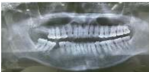
Figure 3 Panoramic x-ray

Panoramic and TMJ x-ray were also carried out in the first visit. Teeth 17 and 46 were missing and according to the TMJ x-ray, there was increasing condylar mobility during mouth opening (Fig.3-4).