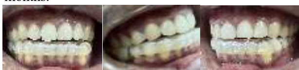
Figure 6 Repaired stabilization appliance

At 2 nd post delivery visit evaluation, patient felt significant improvement, the pain was significantly diminished. No more pain in temporalis area, masseter and sternocleidomastoideus muscle during palpation. Migraine only happens one time from the last visit. Patient managed to control his clenching habit at day-time but unable to manage his sleep bruxism habit. At this visit patient reported that the SA was chipped in the right second molar area so he intended to fix it (Fig.5B). The SA was then fix chairside using self-curing acrylic (Fig.6). Patient was instructed to continue the jaw exercise and scheduled once a month visit for the next 6 months.